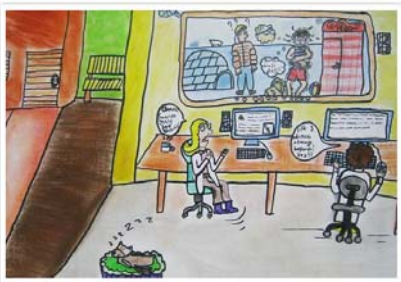
Ecem Diniz 6. Sınıf